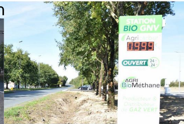
First refuelling station owned by farmers in France Second in Europe after Kalmari farm Finland Astrade source