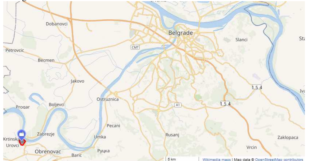
Figure 2: Map of Belgrade area, where it can be observed the distance that the TENT-A pipeline will cover (plan in progress).